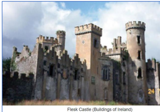
Flesk Castle (Buildings of Ireland)